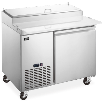
50" Wide 50042