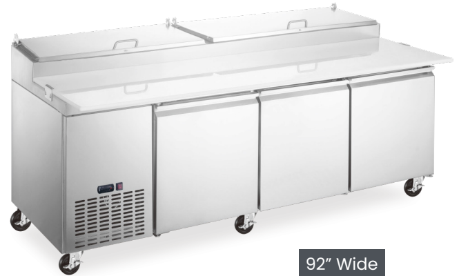
92" Wide 50044