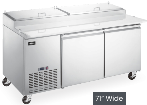
71" Wide 50043